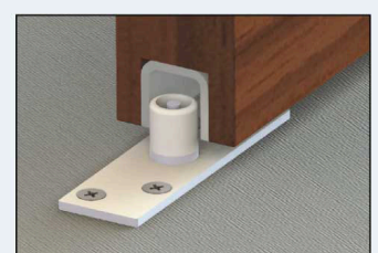
Floor mounted floor guide for timber doors