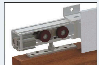
Wall fixed track c/w fascia, hanger & apron plate for timber door